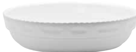
MN32320 / MN320400