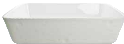
MN9910320 / MN9910400

Pirofilia tonda cordonata | Round cup | ø 40 cm