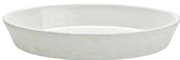
MN9900220 / MN9900580

Pirofila ovale cordonata | Oval roasting dish | ø 58 cm